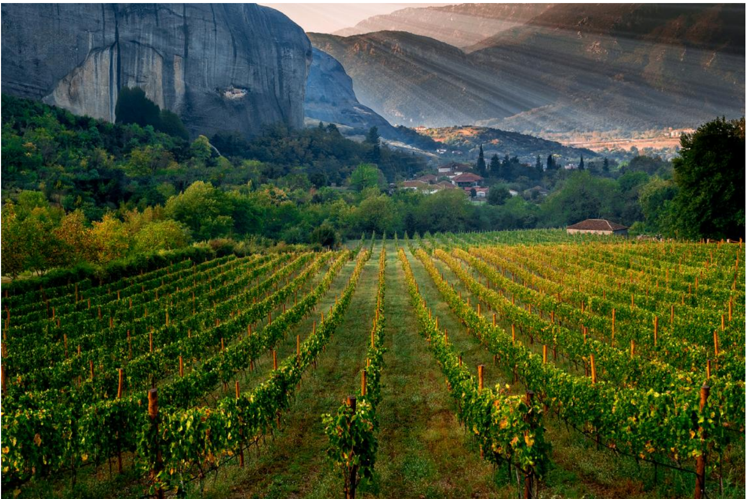
Grape Vines Under Cave of St. George

https://www.cipfestival.com/participating-artists-2020/.